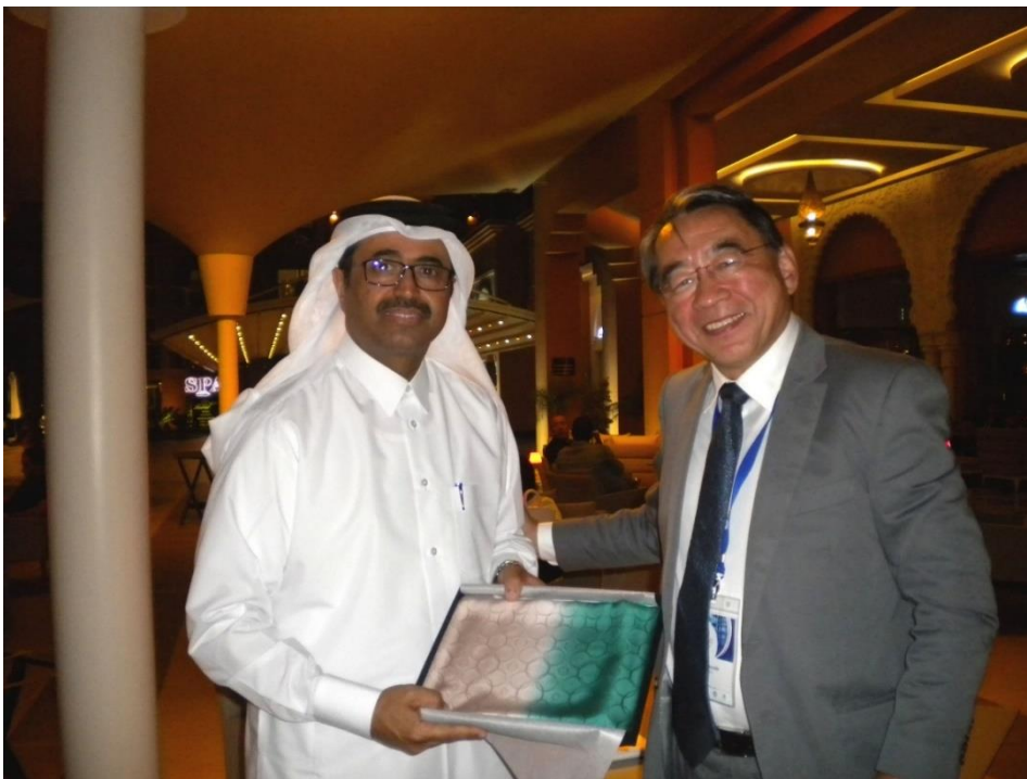
Photo 1 After the meeting with HE Dr. Mohammed bin Saleh Al Sada, Minister of Energy and Industry, Qatar (Left)

In the meeting with HE Dr. Mohammed bin Saleh Al Sada, Minister of Energy and Industry, Qatar, they exchanged information regarding JCCP activities with Qatar, oil affairs and energy policies of Qatar etc., JCCP received the request for the training from Qatar.