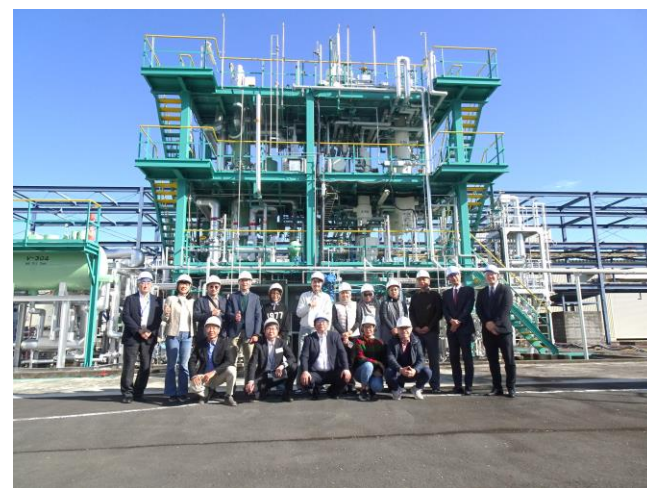
Koyasu Office & Research Park, Chiyoda Corp.