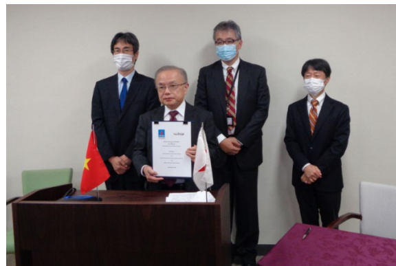
(Technical Cooperation Department)