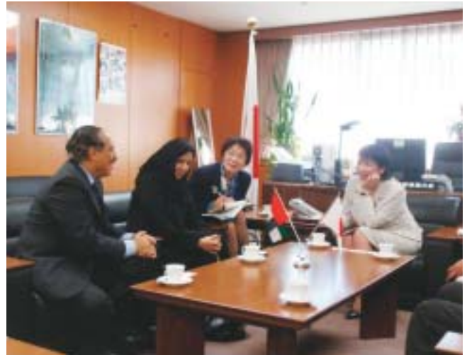
Meeting with Ms. Sanae Takaichi, Vice Minister of Economy, Trade and Industry

Ms. Takaichi emphasized the two country's relationship of mutual trust and cooperation, mentioning that UAE and Japan have formed strong bonds of cooperation through development projects in the oil upstream sector, as well as in a wide range of other sectors, including personal exchanges and