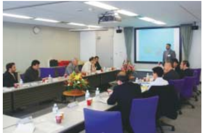
Scientific Council Meeting in session

gas industry, that are being implemented as part of the FY2008 program.