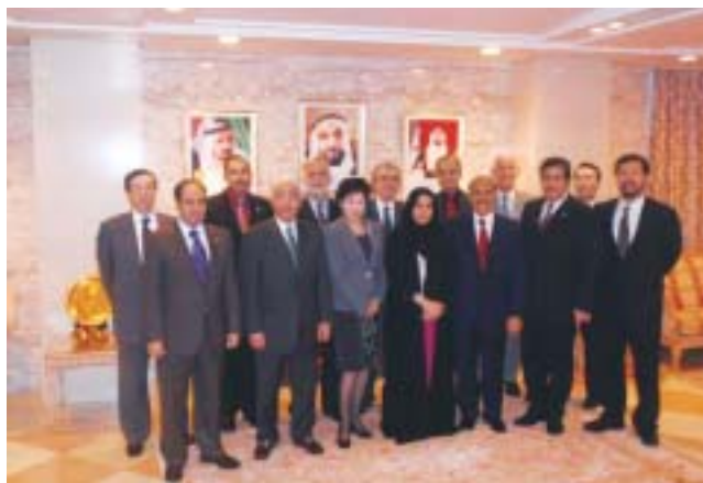
With the ambassadors of Middle East countries in Japan