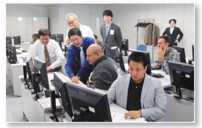
[April 22] TR-1 "Future Technologies in the Oil Industry" (April 7 – 24) Practical training in the CAI Room at JCCP Headquarters