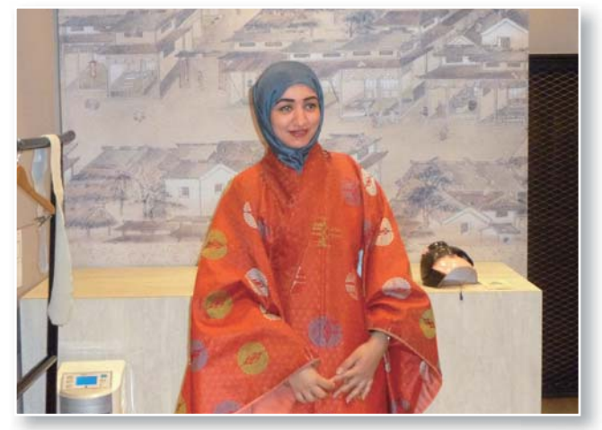
[Sept. 6] TR-8 "Environmental Management for Sustainability" (Aug. 26 – Sept. 12) Exposure to Japanese history and culture in Hiroshima