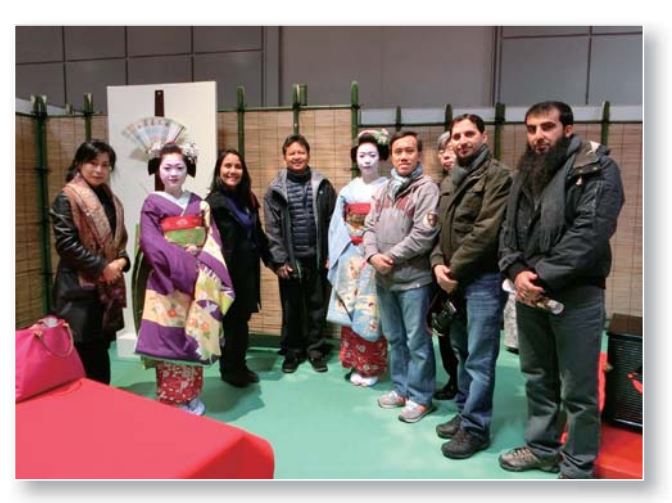
[Dec. 14] TCJ-1 "JCCP Program Seminar" (Dec. 11 – 17) Posing with an apprentice geisha during a history and culture excursion to Kyoto