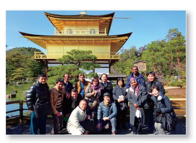
[Feb. 21] TR-21 "Quality Management of Refinery Products" (Feb. 10 – 27) History and culture excursion to Kinkakuji Temple