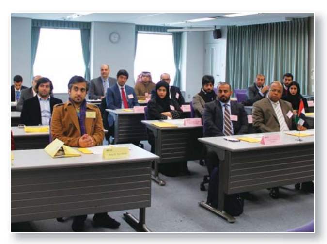
[Feb. 9] CPJ-83 "Refinery Maintenance Management for Productivity Improvement" (Feb. 9 – 20) CPJ-84 "Marketing and Trading" (Feb. 9 – 13) Joint opening ceremony for customized programs for the ADNOC Group