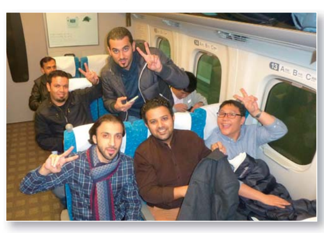
[Dec. 4] TR-17 "Wide Scope of Downstream Safety Management" (Nov. 25 – Dec. 12) On a Shinkansen bound for Hiroshima