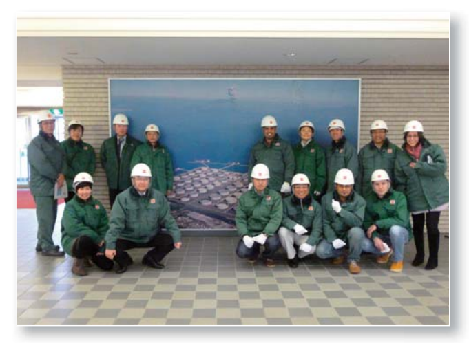
[Jan. 26] TR-20 "Petroleum Distribution" (Jan. 13 – 30) At JX Nippon Oil & Energy Corporation's Kiire Terminal