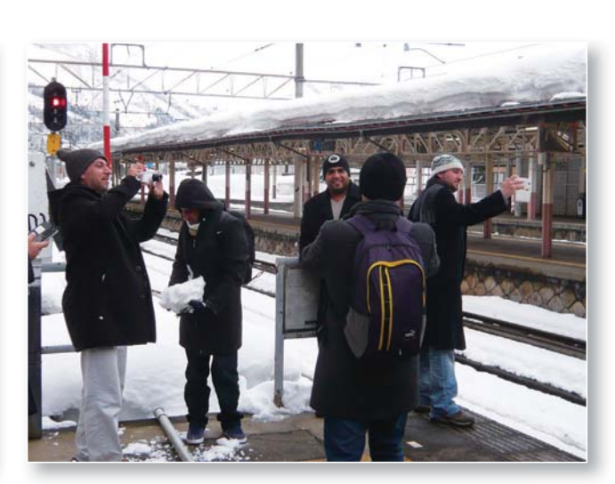
[Jan. 29] CPJ-82 "Environmental Management and Advanced Technologies" (Jan. 27 – Feb. 5) Enjoying the snowy landscape in Echigo-yuzawa