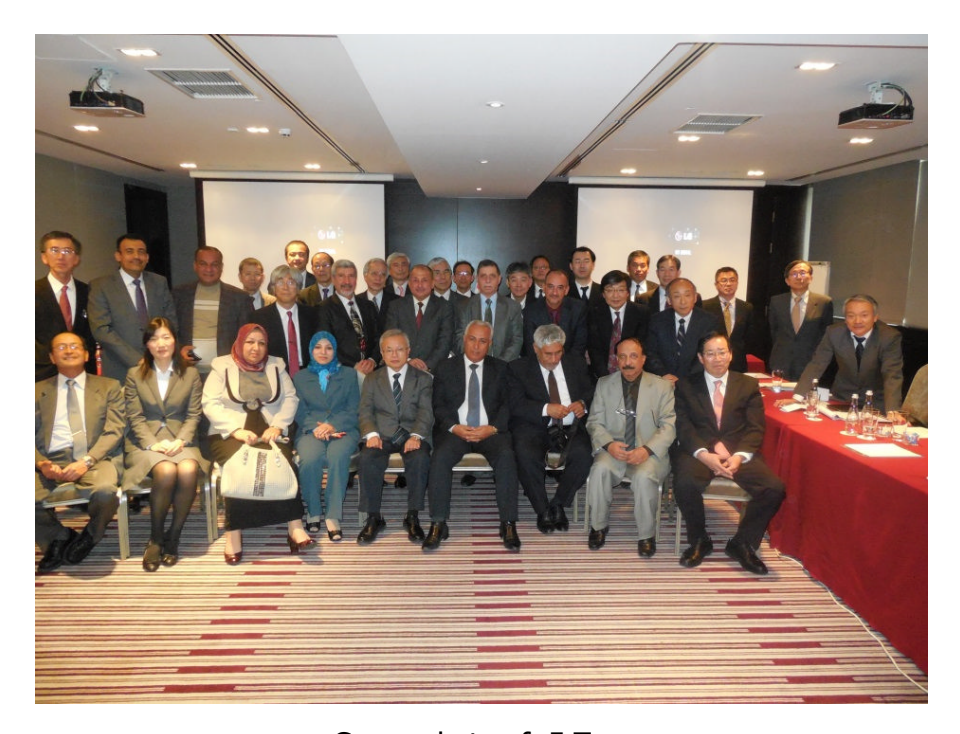
Group photo of 5 Teams (11 from Ministry of Oil in Iraq and 23 from Petroleum related organizations in Japan)