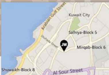
JW Marriott Hotel Kuwait City

Japan Cooperation Center, Petroleum E-mail: webmaster@jccp.or.jp 58FL., Sunshine 60 Building, 3-1-1 Higashi Ikebukuro, Toshima-Ku, Tokyo, Japan TEL:+81-3-5396-6000 FAX : +81-3-5396-6006