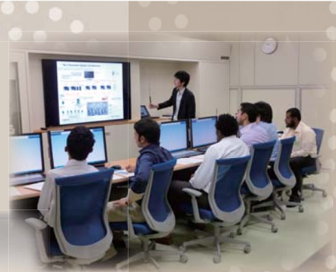
Japan Cooperation Center, Petroleum