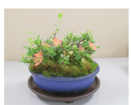
- Bonsai tree of this week -Choujju-bai (Mauls quince)

11 Participants will have great opportunity to gain provide knowledge on the future technologies such as renewable energy, solar power generation, hydrogen society and carbon dioxide capture and storage (CCS).