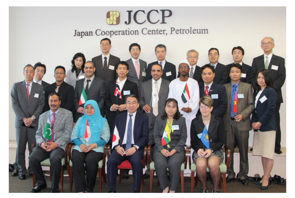
Group photo after the ceremony ↑