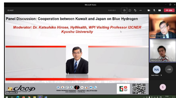
Panel Discussion (Online)