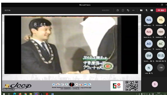
Video Footage of Japan-Kuwait Exchange History